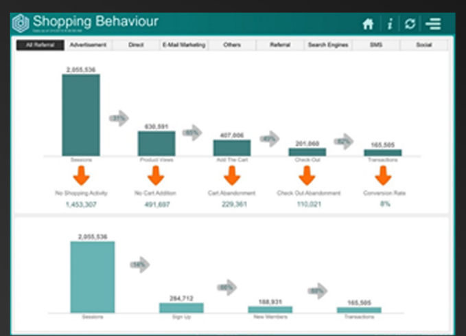
No Shopping Activity, No cart addition, Cart Abandonment, Check out Abandonment, Conversion Rate